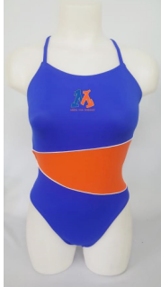
MDA Team Suit - $67