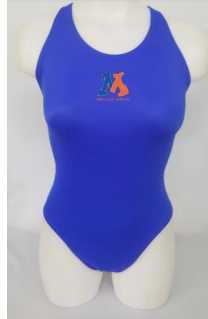
MDA Competition Suit - $50